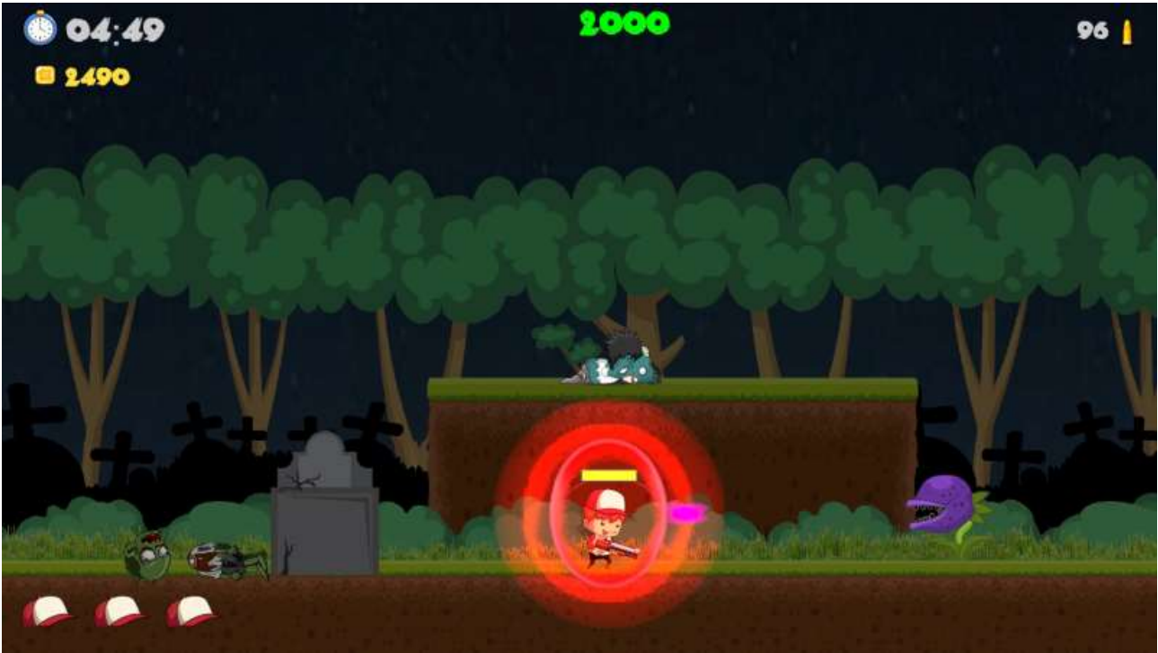
Red Cap with the eShield