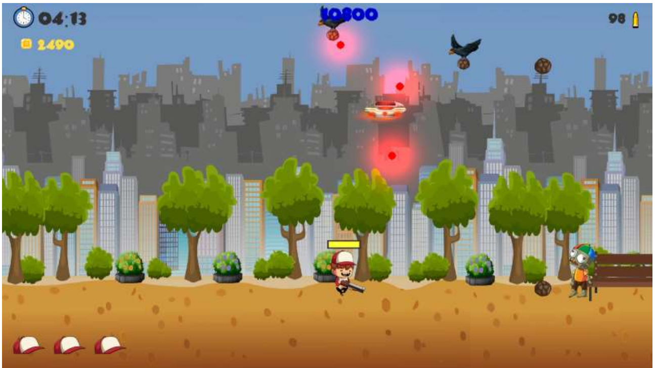
Red Cap with the Robot