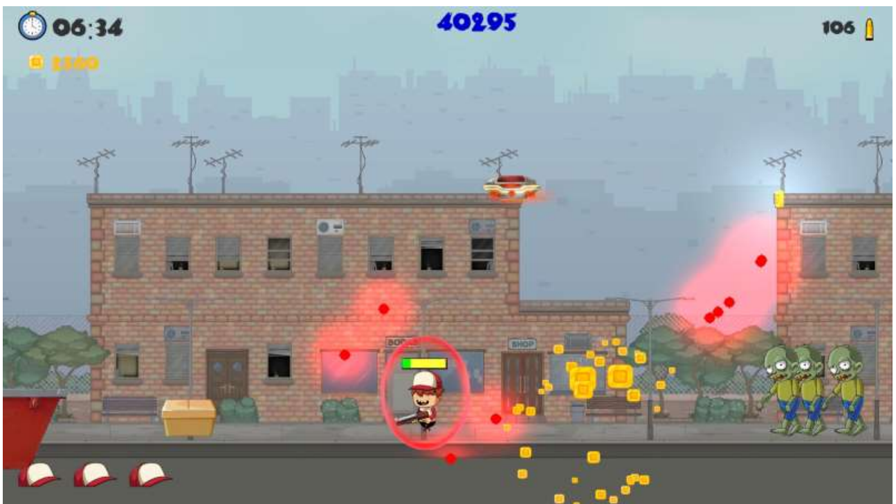
Red Cap with eShield, Laser wheel and the Robot