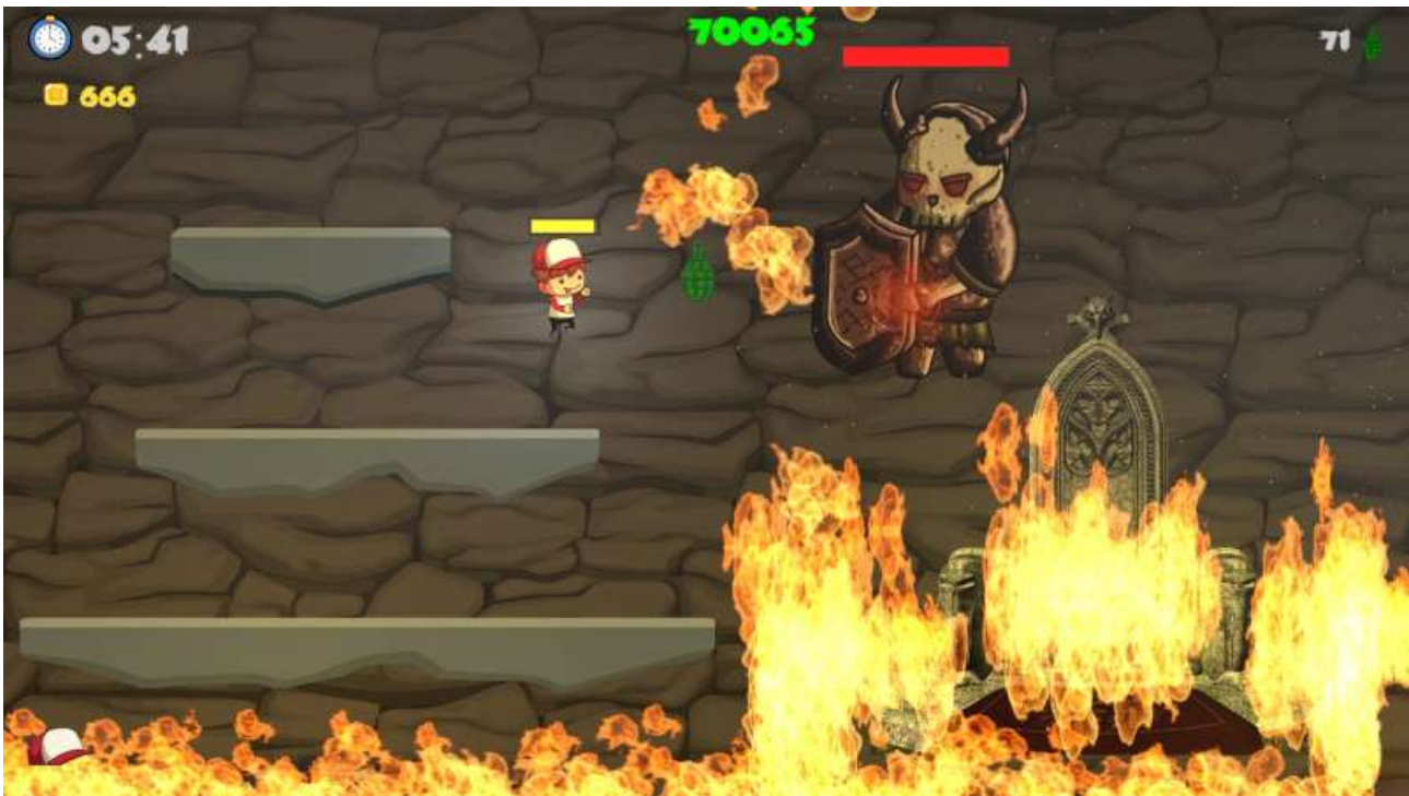
The king of catacombs won't let you go

In the second stage , when he finally reaches the city, he finds a bleak panorama: in the parks the children have already become zombies, the citizens who are still normal and the zombies share the streets . When he passed a construction site, the zombie workers tried to eat him. Some policemen turned into zombies fire their guns. Red Cap will be forced to use the subway to avoid the streets and get to the Anti-Zombies Army (AZA) office as soon as possible.