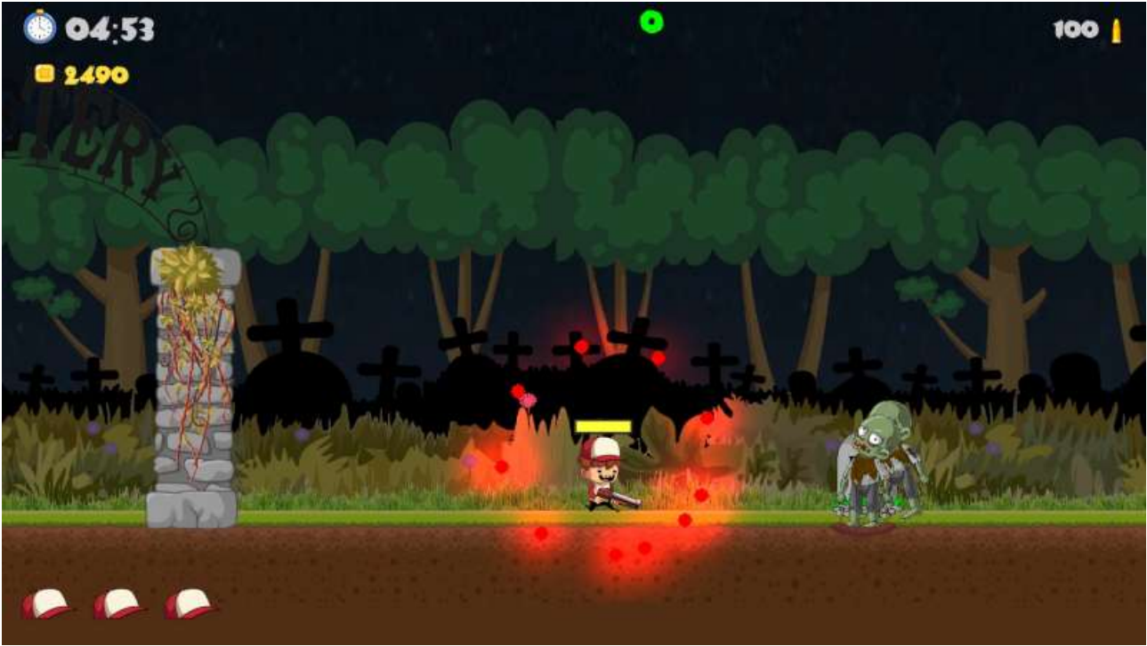
Red Cap with the Laser wheel